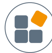
SAP Ariba Open API