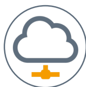
Cloud Integration Gateway (CIG)